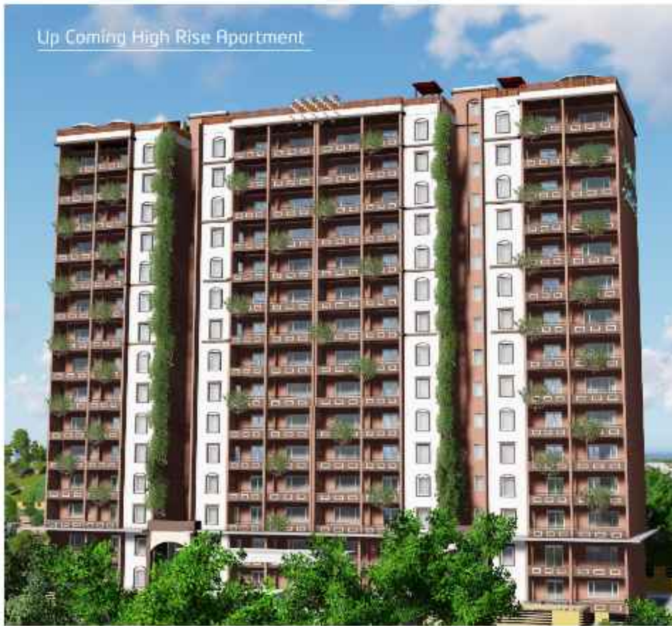
Up Coming High Rise Apartment