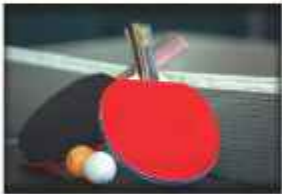
TABLE TENNIS TALK WITH YOUR RACQUET, PLAY WITH YOUR HEART

GYMNASIUM PUSH HARDER THAN YESTERDAY IF YOU WANT A DIFFERENT TOMORROW. FITNESS IS NOT A DESTINATION IT IS A WAY OF LIFE.